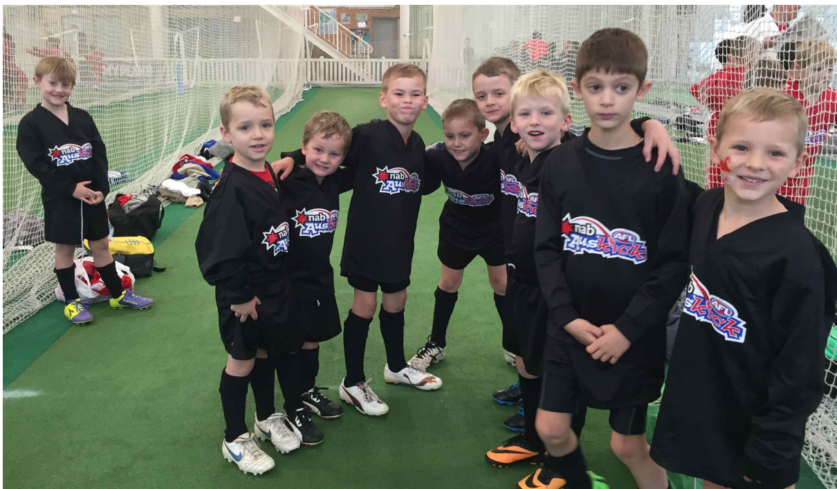
Dockers Auskickers preparing for their game on the SCG during the Swans – Eagles match on April 24 th .

As a guide please organise to be at the field 30 minutes before your scheduled warm up time fully dressed in your game gear so that we can take team photos – your manager will be back to you with an exact time. We would really appreciate you being as prompt as possible to ensure no one misses