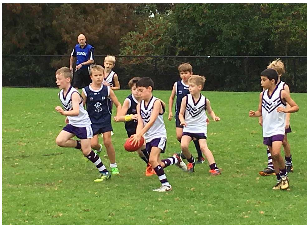
U9 Whites in action