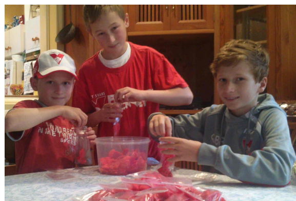
A trio of lolly-baggers helping with preparations for the Club canteen.

Was not a day for the tall timber but Haz (B2) did everything the coaching staff could have asked. Rucked all day, as usual. Won 65%, as usual. When we get out stoppage systems sorted out and win 65% of the clearances we'll be hard to stop. Playing mainly off half forward Rory showed some deft touches early and looked a dangerous attacking option with ball in hand.